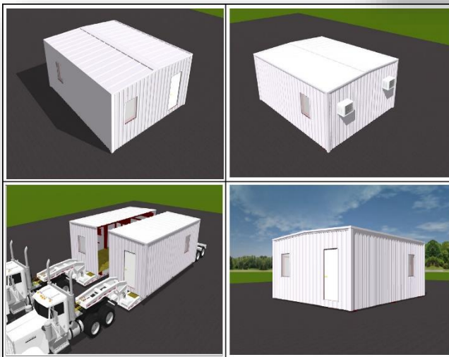
FastFlex Pre-Fabricated Buildings shown above in 11' x 27' specifically designed to fit on a flatbed semi-trailer.